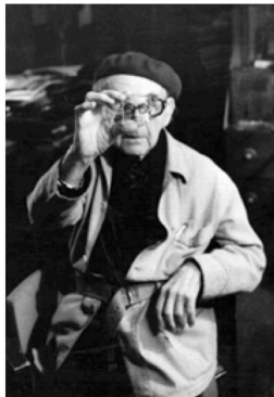
Man Ray

Exhibition continues through December 17 th